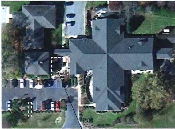
Veterans Walkway & Garden The Courtyard